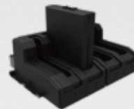
4-bay Battery Charger