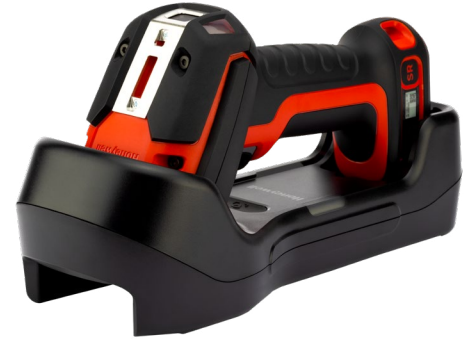
Honeywell Granit Ultra 2105i Ultra-Rugged Scanner

The all new charge and communication base is loaded with features to simplify common tasks. Easy drop-in charging makes scanner placement in the cradle fast and efficient for flat work surfaces; engaging the latching mechanisms helps ensure secure retention for vertical or vehicle mounting.