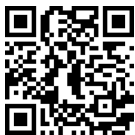
UX10-IP 3D demo