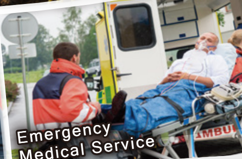
Emergency Medical Service