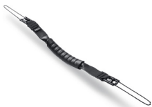
Flexible Handle - SWT-FLXHD

Mount your tablet instantly to any metal surface with a powerful VESA magnetic backplate.