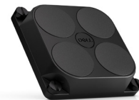
Magnetic Mount - SWT-MAGMO

Ergonomic strap that attaches to the corner tethers of your tablet for enhanced portability.