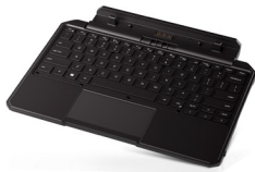
Premium Keyboard - SWT-KBD

Increase productivity with this IP-65 rated keyboard that is completely sealed off from the elements.