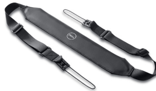
Shoulder Strap - SWT-SHSTP

Reversible, removable handle with angled design makes it easy to reach the controls in the tablet's configurable bay.