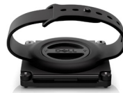
Rotating Hand Strap - SWT-ROTHS

Increase productivity with this IP-65 rated keyboard that is completely sealed off from the elements.