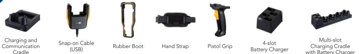
Charging and Communication Cradle