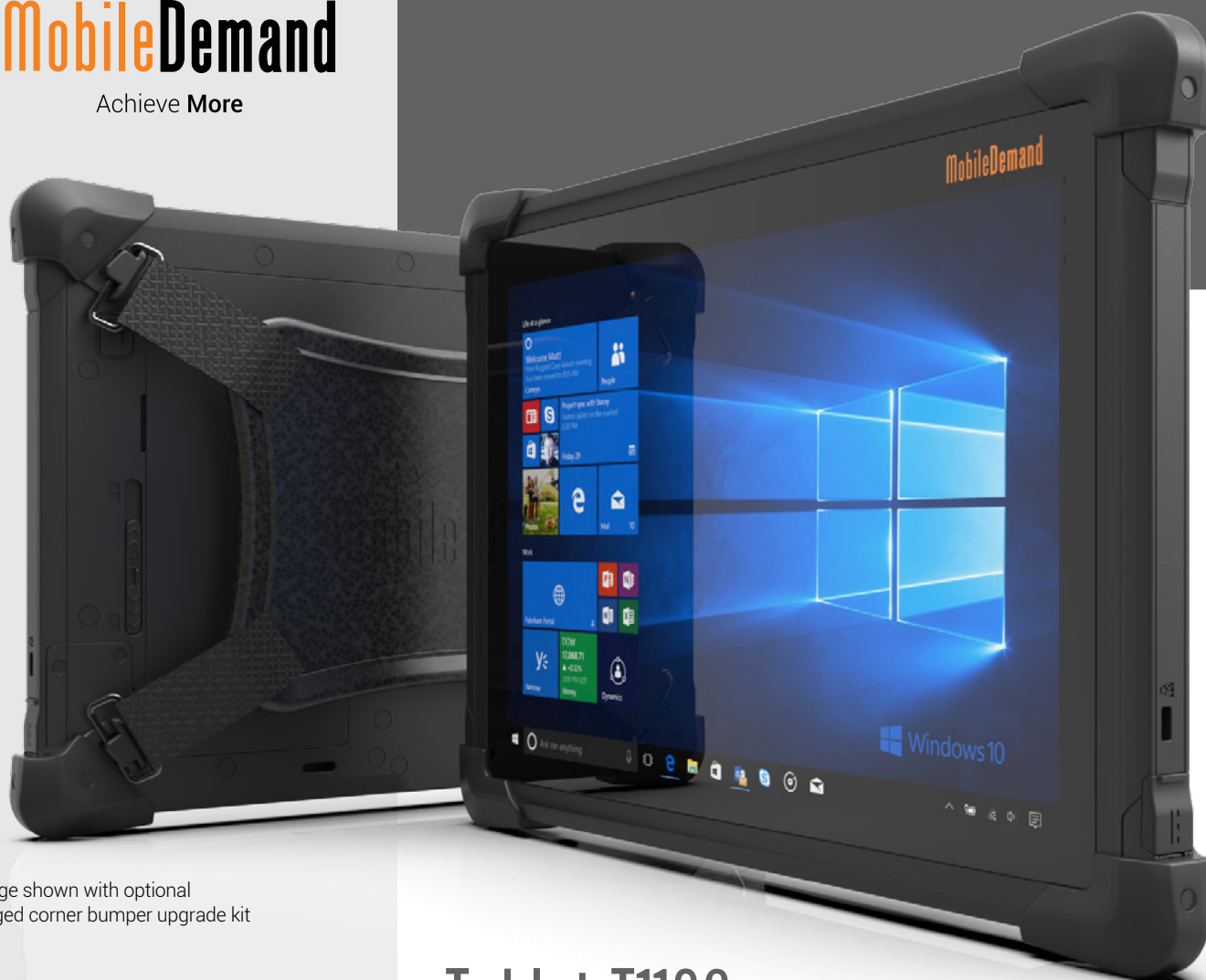
Image shown with optional rugged corner bumper upgrade kit