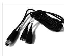
Two USB Ports, One Connector