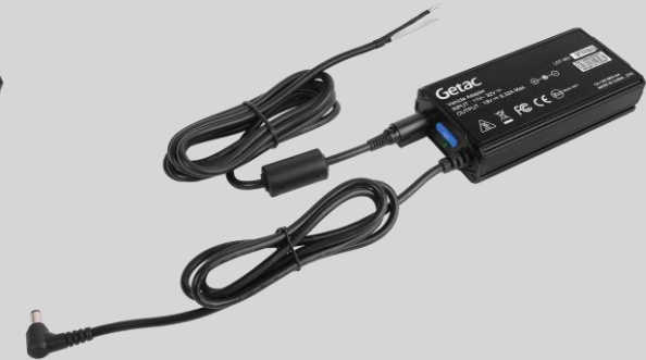
Bare Wire Version