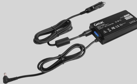
Cigarette Lighter Plug Version