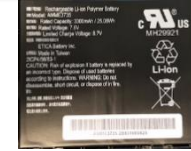
BTRY-ET5X-8IN3-01 8 in. Tablet Internal Battery