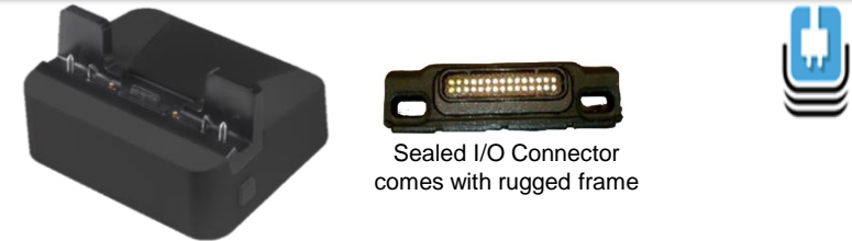
CRD-ET5X-1SCOM2R 1-Slot Dock with Rugged IO Adapter