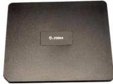
KT-ET5X-8BTDR2-01 ET51/ET56 8" Battery Door