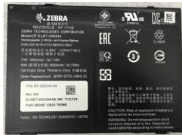
BTRY-ET5X-10IN5-01 10 in. Tablet Internal Battery