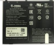
BTRY-ET5X-8IN5-01 8 in. Tablet Internal Battery