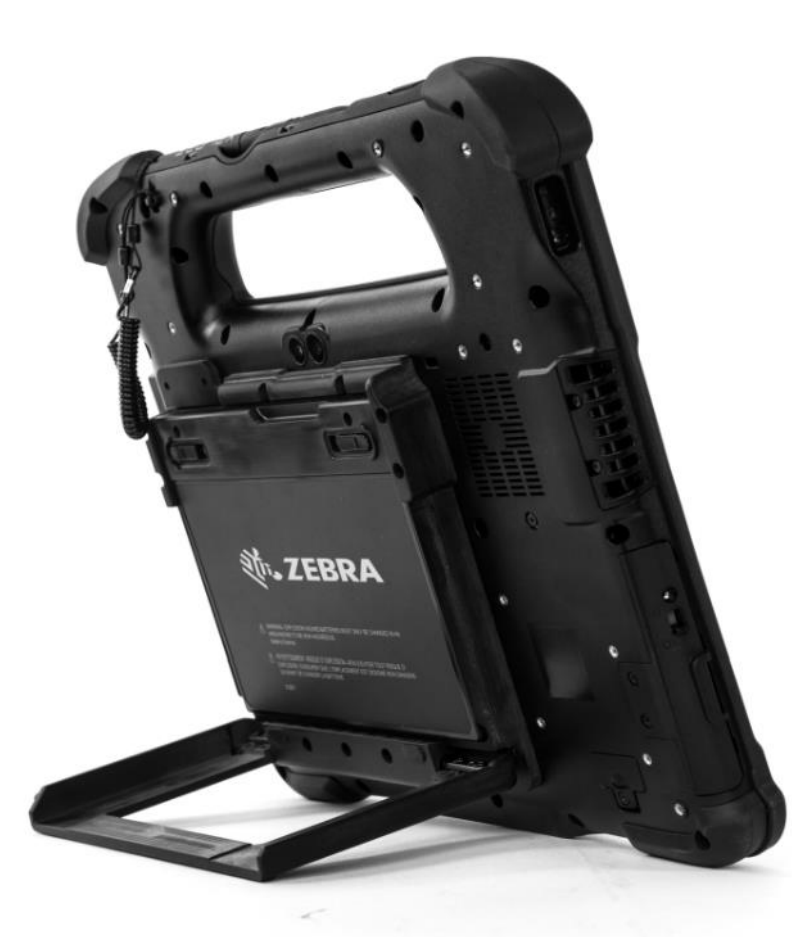
Part Numbers : 410056 (L10 Kickstand Extended Battery Bracket kit)