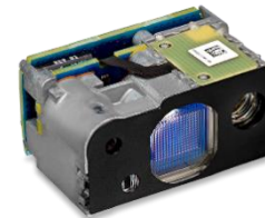
TC8XXX-3 Extended Range Imager