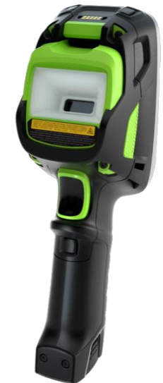
TC83XX-4/5 DPM Imager w/ light diffusion *