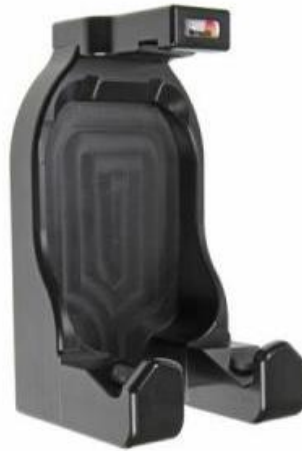
MNT-TC8X-FH-01 TC8XXX Forklift Holder