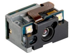
TC8000-1 Standard Range Imager