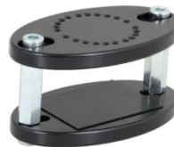
3PTY-PCLIP-215677 Forklift Clamp Mount