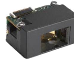
TC8XXX-A 1D Standard Range Laser