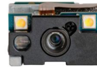
TC8XXX-2 Medium Range Imager