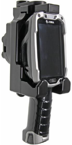
MNT-TC8X-FLCH-01 Forklift Holder for TC8000