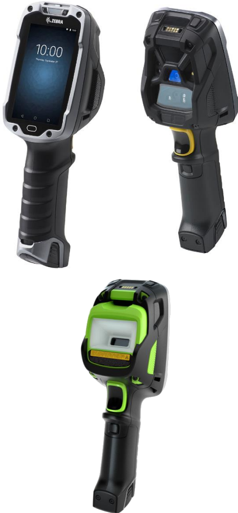
TC8300 DPM w/ light diffusion *