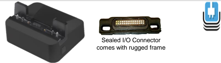
CRD-ET5X-1SCOM2R 1-Slot Dock with Rugged IO Adapter