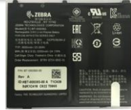
BTRY-ET5X-8IN5-01 8 in. Tablet Internal Battery