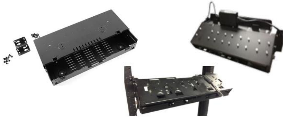
BRKT-SCRD-SMRK-01 Multi-Slot ShareCradle Mounting Bracket