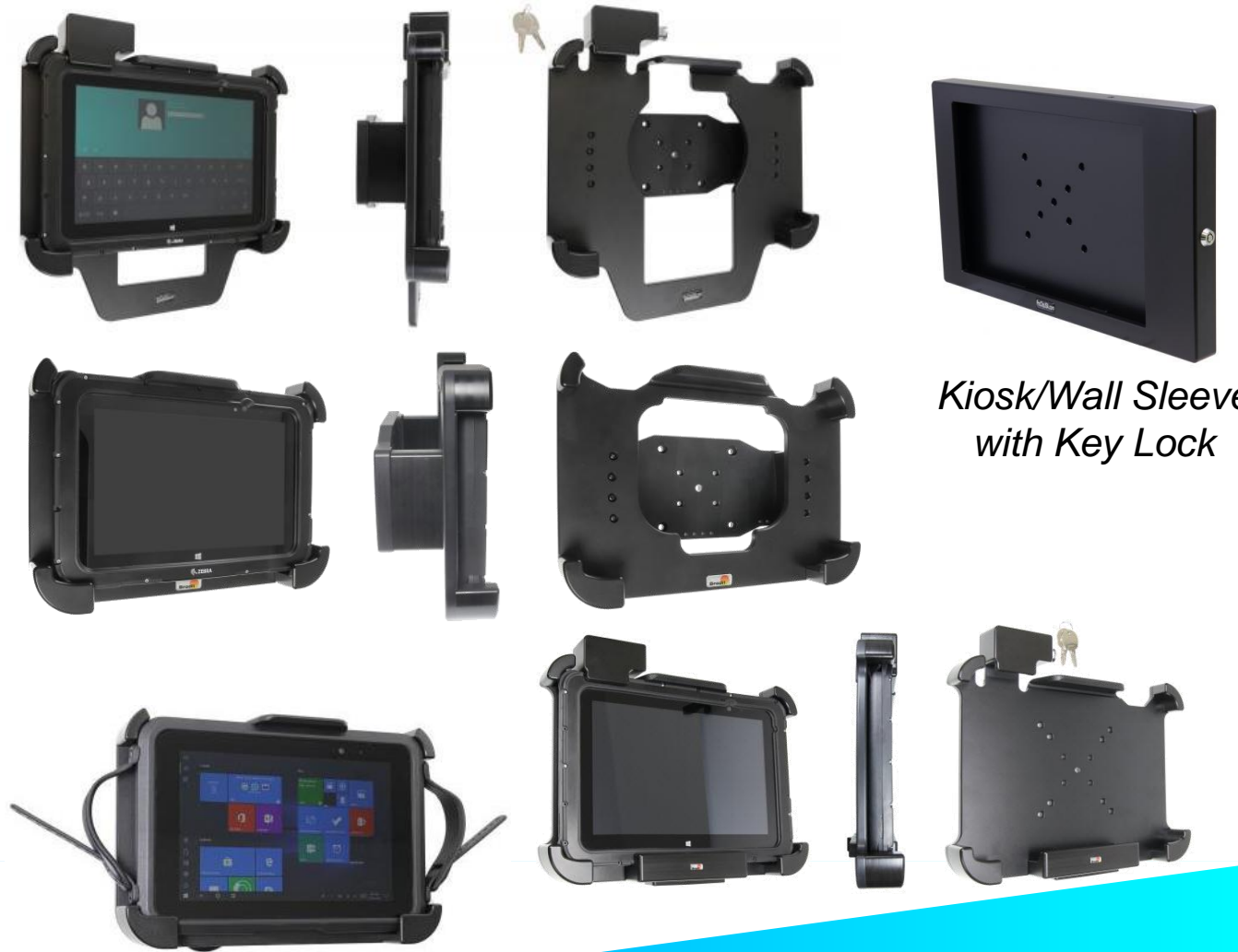
Kiosk/Wall Sleeve with Key Lock

For Europe contact Brodit AB Sweden, www.brodit.se