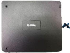
KT-ET5X-8BTDRSA1-01 ET51/ET56 8" Battery Cover Attached with Screws (Included)