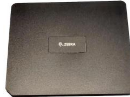
KT-ET5X-10BTDR2-01 ET51/ET56 10" Battery Door