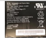
BTRY-ET5X-8IN3-01 8 in. Tablet Internal Battery