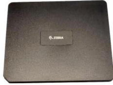
KT-ET5X-8BTDR2-01 ET51/ET56 8" Battery Door