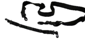
SG-ET5X-SHDRSTP-01 Break away Shoulder Strap