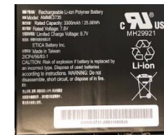
BTRY-ET5X-10IN3-01 10 in. Tablet Internal Battery