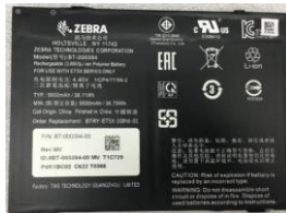
BTRY-ET5X-10IN5-01 10 in. Tablet Internal Battery