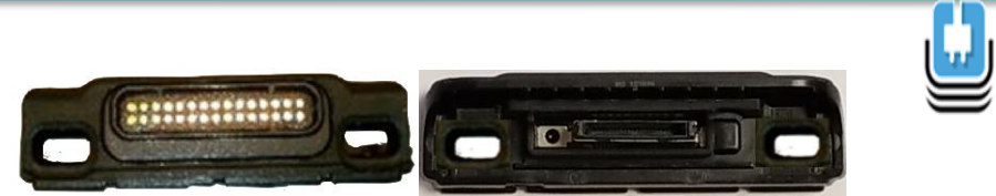
SG-ET5X-RGIO2-01 Replacement Rugged I/O Connector