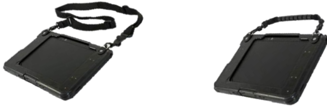
SG-ET5X-HNDSTP-01 Handle strap