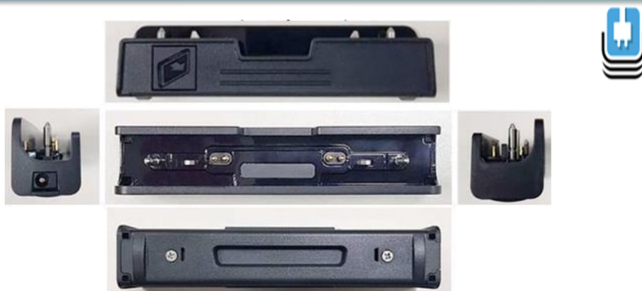
CHG-ET5X-CBL2-01 Rugged Charge Connector