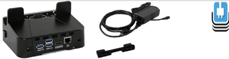
CRD-ET5X-1SCOM1 ET5X 1-Slot Charge and Communication Dock