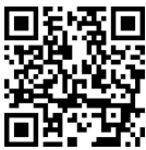
UX10 3D demo